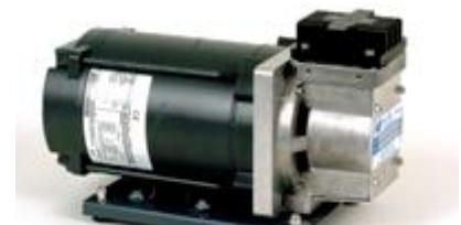
IR-1050 Centurion Explosion-Proof Pump

The single-head handles a pressure range of 6.1-71 PSIG, the dual-head handles a pressure range of 55-75 PSIG, and the quad-head handles a pressure range of 70-75 PSIG, all depending on how they are configured. The single-head has a vacuum range of 8.4-25.2 In Hg, the dual-head has a vacuum range of 24-28.4 In Hg, and the quad-head has a vacuum range of 24.8-29.3 In Hg, depending on configuration. The single-head has a maximum flow range of 9.4-30.2 LPM, the dual-head has a maximum flow range of 51.1-73, and the quad-head has a maximum flow range of 100-142.2, depending on configuration.